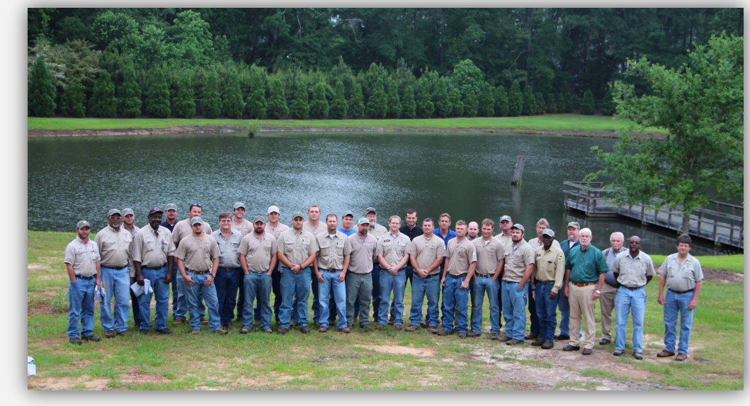
GRADY EMC LINE CREWS & RIGHT OF WAY CREWS

Grady EMC is thankful for the group of men who have chosen to invest their lives and energies into keeping our power grid operational. Our organization's reputation in this community is built on their exceptional skill and professionalism. The next time you see one of our linemen out in the community, join us in recognizing them for the vital work they do!