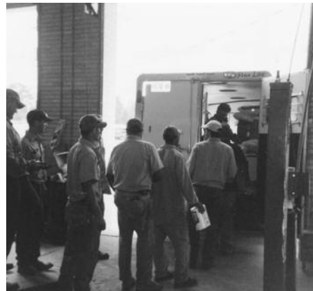
Also pictured is a group of Grady EMC employees as they help load items onto the trailer. The trailer was completely packed as they left.